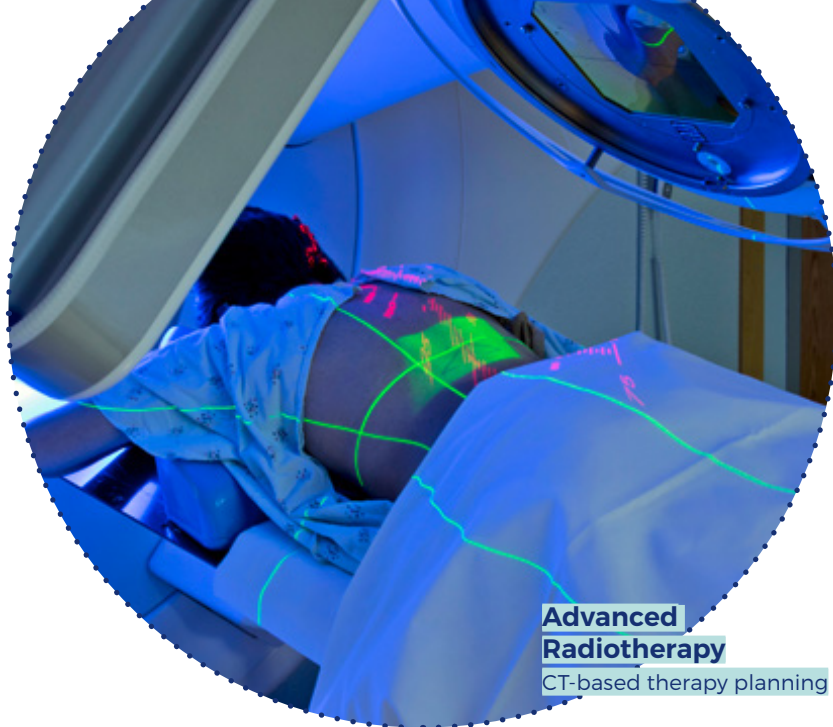
Advanced Radiotherapy CT-based therapy planning